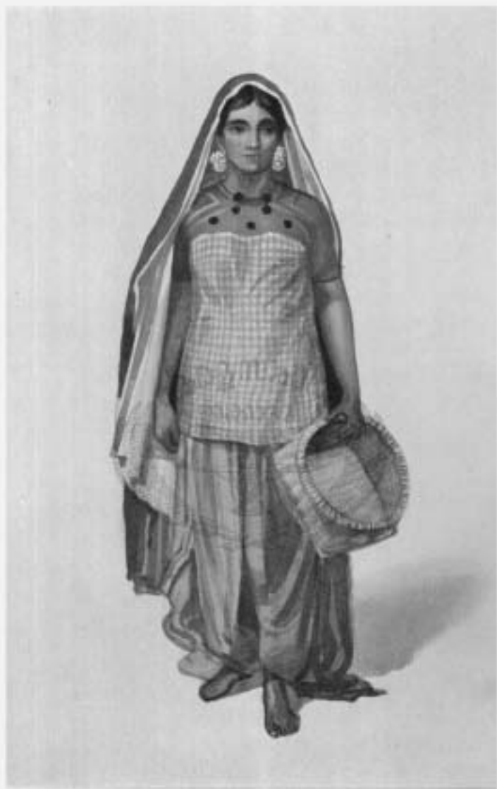
FISHER WOMAN OF SIND